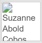
Suzanne Abold Cobos

Wadene Kerby - August 21, 2015 at 03:02 PM